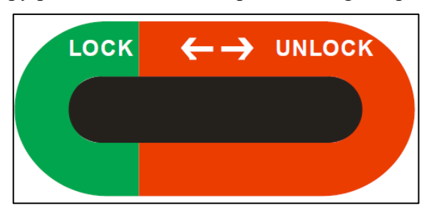
Fig. 2: Canopy placard – current improved design

2. Install new canopy placards in current improved design as per Fig. 2 below: